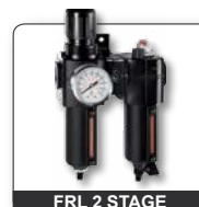
FRL 2 STAGE

FRL units will improve the productivity and lifetime of your pneumatic tools.