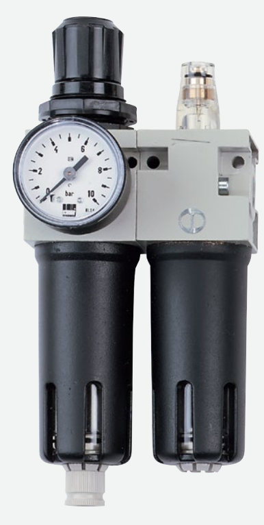
Filter regulator - Lubricator