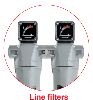
Can be added for high-quality air.

Thanks to its wide range of options and flexible build, the QRS 3-10M can accommodate all your requirements.