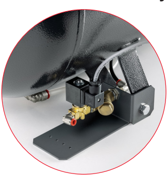
Low-loss timer drain Removes tank condensate.