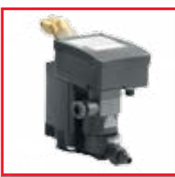
Capacitive Drain CPX850-CPX2500

Monitor the operations and dew point of your CPX dryer with the electronic controller.